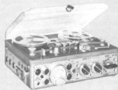
SL STEREO SYNC RECORDER