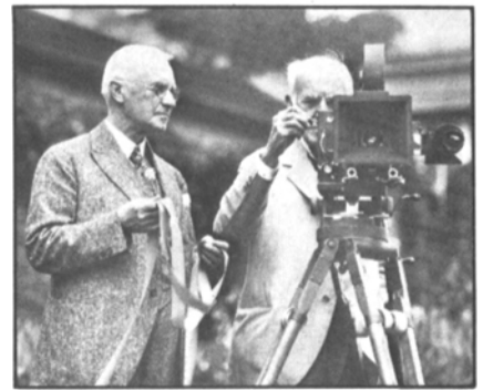
Eastman & Edison, p. 552