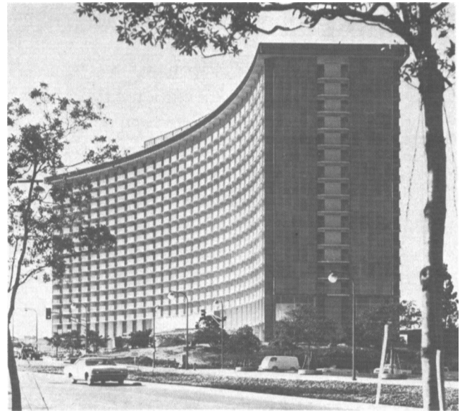
Century Plaza Hotel, Los Angeles

The rates for suites begin at $110. Details can be obtained from the hotel.