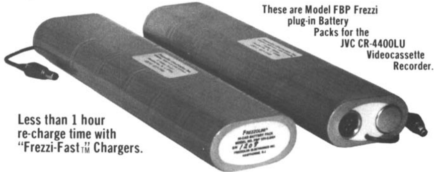
These are Model FBP Frezzi plug-in Battery Packs for the JVC CR-4400LU Videocassette Recorder.