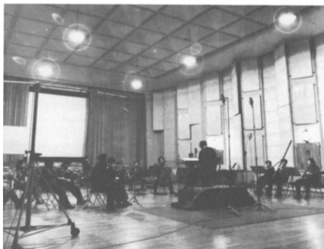
Fig. 2. Sound recording hall for music in the Central Newsreel and Documentary Film Studio