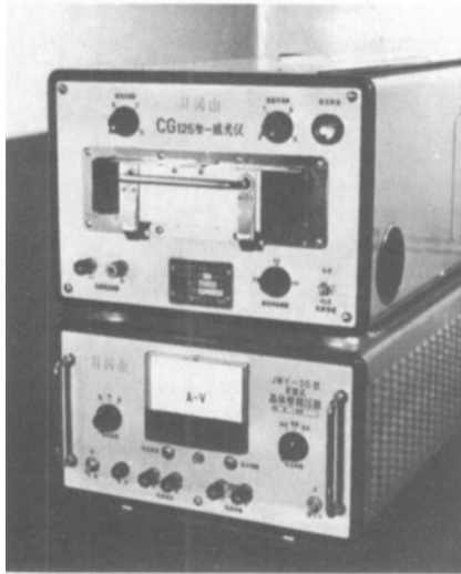
Fig. 3. Ching-Gong-Shan sensitometer (made in Shanghai).

area. In addition, they asked to see an optical house, CBS Broadcast Center and Du Art Film Laboratory in New York City and were taken to visit all the areas. On Friday after the Conference was over, the delegation visited the Eastman Kodak facility in Rochester, and the following week went to Hollywood where they visited Consolidated Film Industries' Laboratory and Video Tape Division, Image Transform, De Luxe Laboratories, Todd A-O, the Burbank Studios and Sound Department, Cinema Products, Hollywood Film Co., Universal Studio Special Effects Department, Paramount Studio Special Effects Department, and the Cinema Department of the University of Southern California.