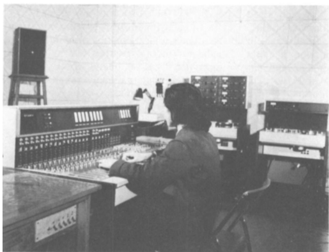
Fig. 1. Sound mixing console in the sound recording room of the Central Newsreel and Documentary Film Studio in Peking.