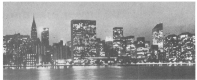
The magic of Manhattan by night.