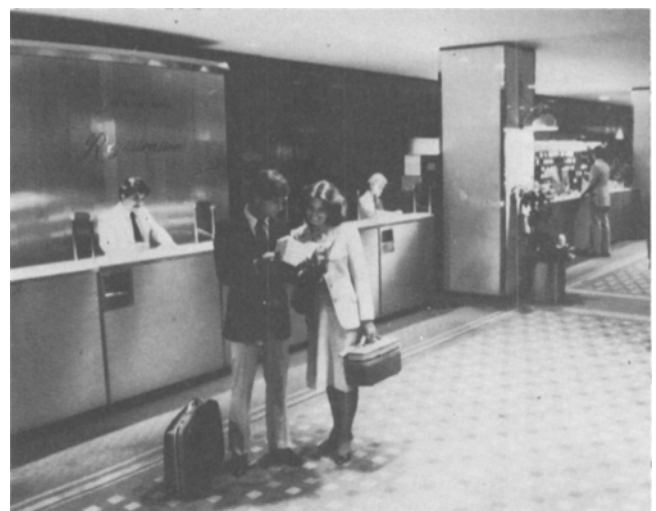
Registration desk, New York Hilton.

This will be the largest exhibit in SMPTE history, with more than 130 companies scheduled to participate. The exhibit will occupy the entire second floor of the Hilton, and will fill Albert Hall at the nearby Sheraton to capacity as well. For a listing of the exhibitors participating, see the Directory of Exhibitors and the floor plan following the program.