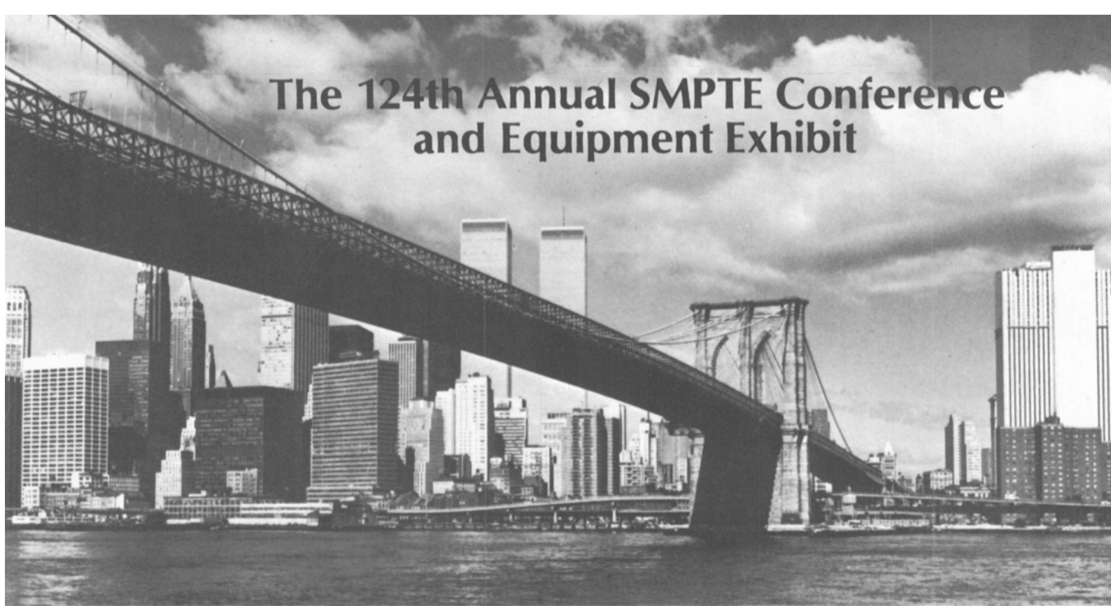
Brooklyn Bridge and lower Manhattan skyline.

The New York Hilton Hotel will once again be the site of the SMPTE Annual Technical Conference and Equipment Exhibit, November 7-12, 1982.