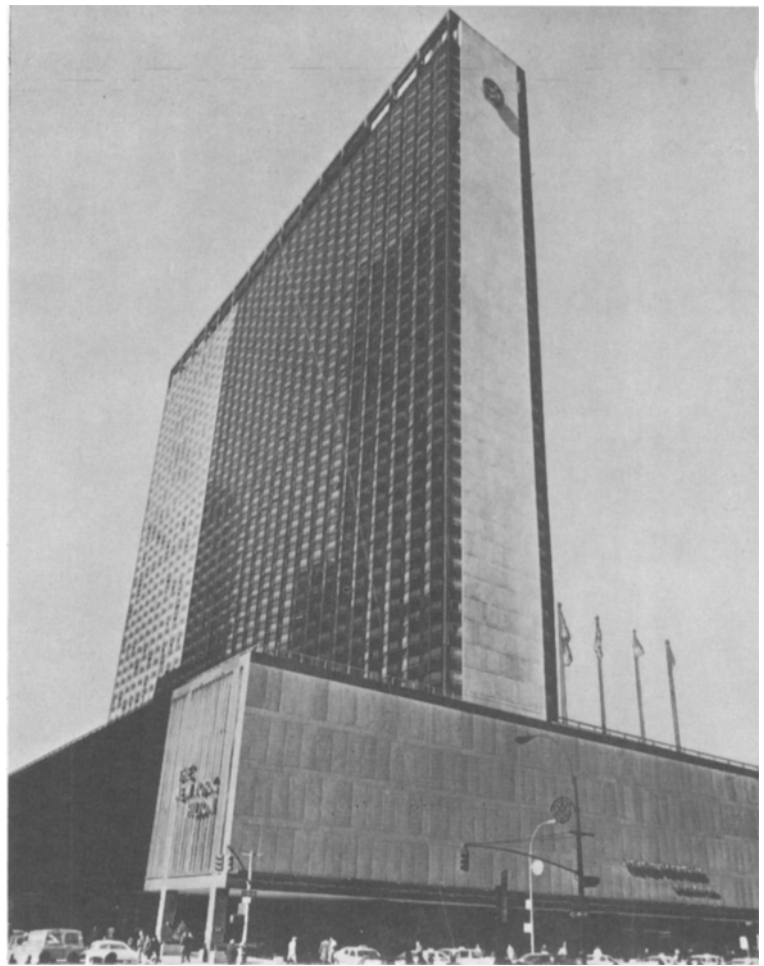
New York Hilton Hotel.

On Saturday, the all-day meeting will kick off with a business meeting of Laboratory members at 8:30 a.m. The Laboratory Equipment and Techniques Forum will follow at 9:30 a.m., with a break at noon for lunch, and will conclude at 5:00 p.m. Papers presented at the Forum will feature lively discussions and equipment of interest to the motion picture and videotape laboratories and their customers.