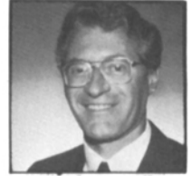
Frank Hauser Laboratory Practices: New Film and Equipment Topic Chairman