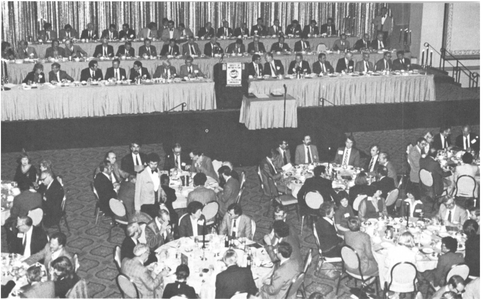
The 1982 Honors and Awards Luncheon.

ernors reception to honor the awards recipients. They were seated on the dais at the Honors and Awards Luncheon, held in the Grand Ballroom of the Hilton.