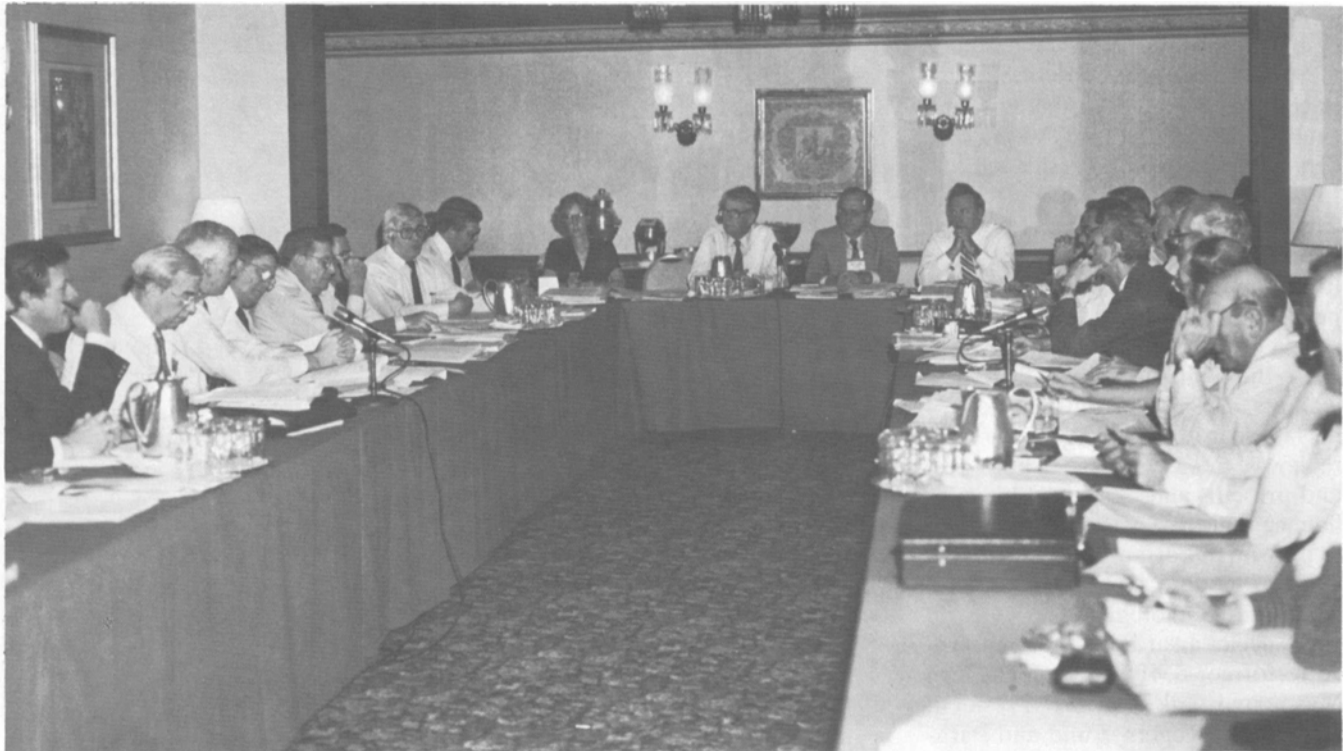
The Board of Governors Meeting.