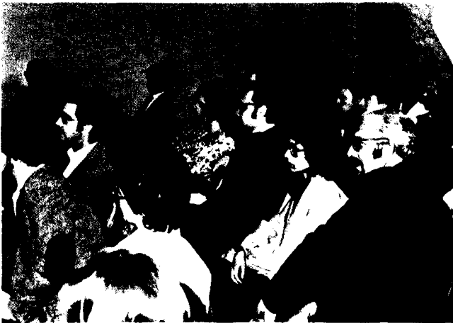
The Chicago Section had the opportunity to observe both the technical and the creative aspects of TV commercials.

cyclopedia Britannica Educational Corporation, 8513 W. North Terrace, Niles, IL 60648.