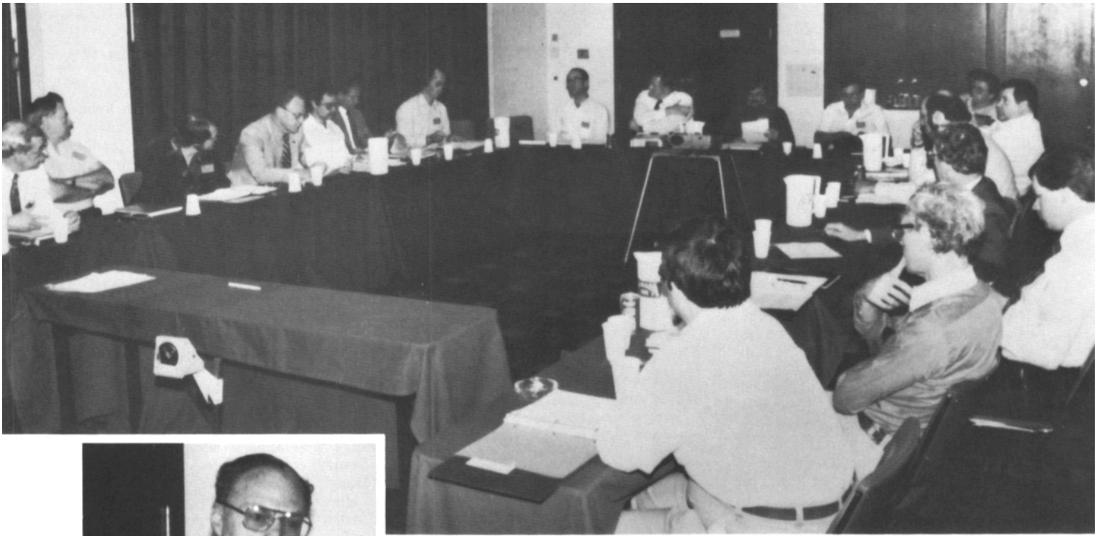
An overview of the participants in the seminar.