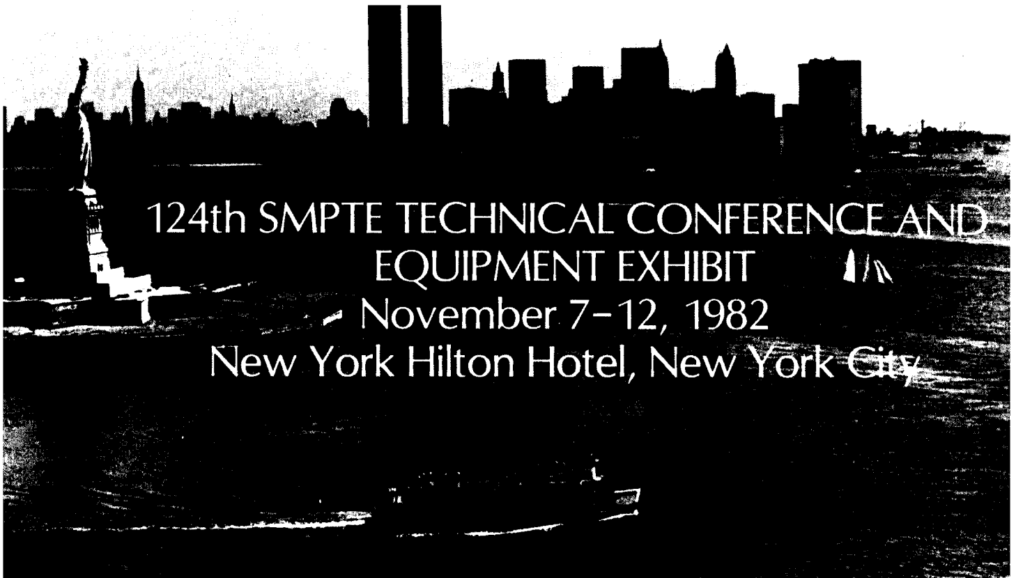
The Statue of Liberty and New York Harbor.

The 124th SMPTE Conference and Equipment Exhibit, the only conference and exhibit of its kind, will continue to give you the latest in technical information by way of its five days of concurrent papers sessions and its three-day exhibit of the latest equipment that the motion picture and television industries have to offer. More than 400 booths will be occupied by 130 or more companies. The exhibit will be open from Tuesday morning through Thursday evening.