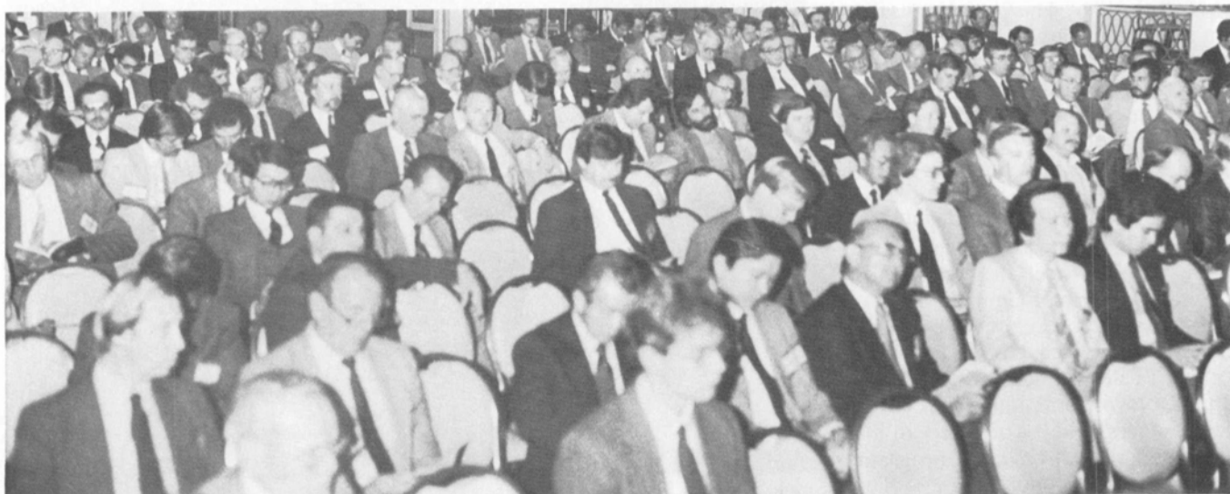
The Opening Session in the Trianon Ballroom.