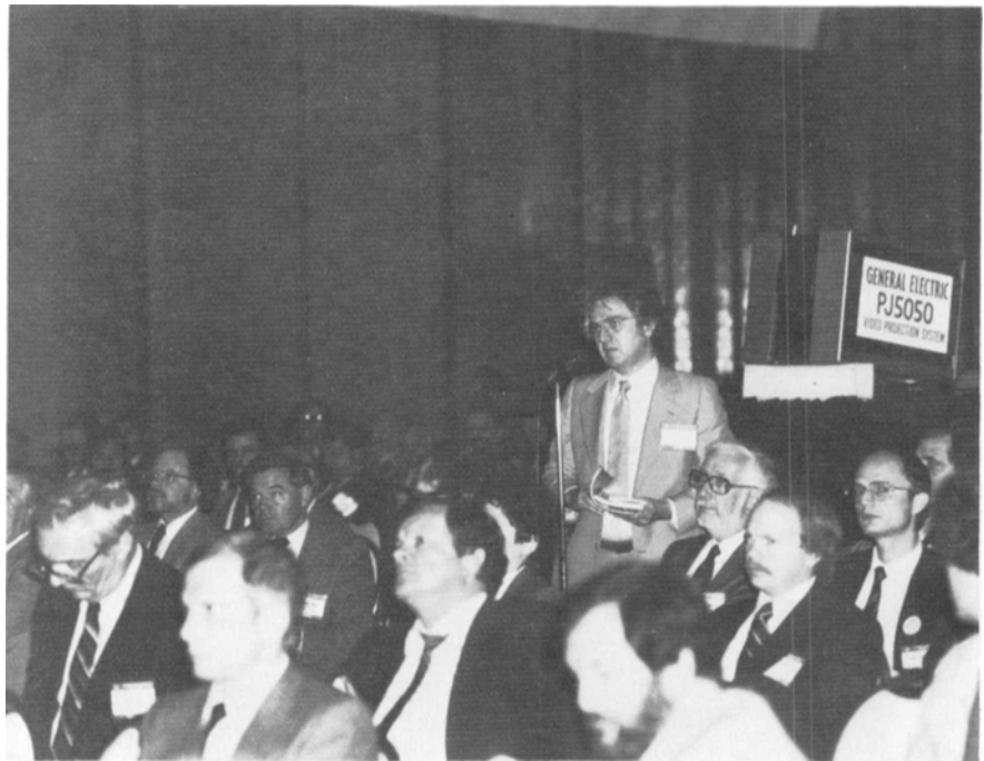
Questions from the floor during a technical session.

Plans for future SMPTE Conferences include the 125th in Los Angeles October 30–November 4, 1983, and the 126th at the soon-to-be-completed New York Convention Center from October 28–November 2, 1984 in New York City.