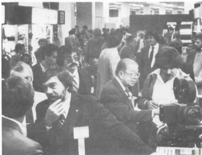
Crowds of people at the Equipment Exhibit.