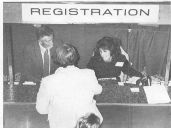
The Registration Desk.