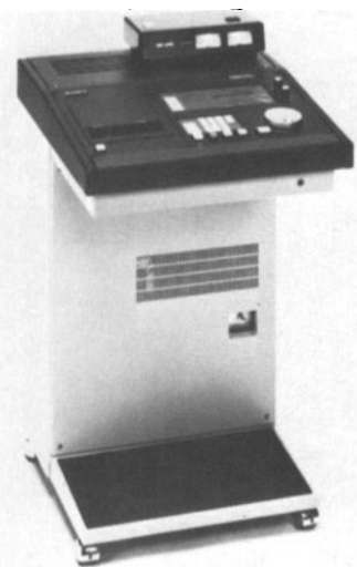
CDP-5000 disk player, Sony

a balanced, manageable configuration. Together the KY-1900U, the HR-C3U, and the KA-100 weigh 16.2 lb.