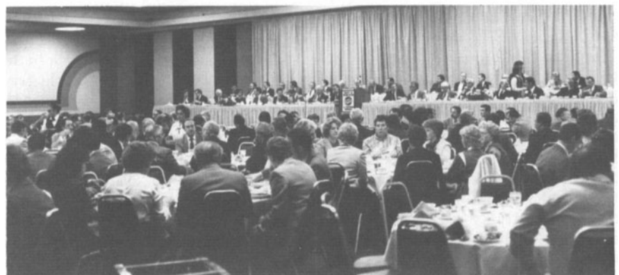
The Honors and Awards Luncheon.

evening reception for registrants sponsored by Eastman Kodak Co. The Honors and Awards Luncheon was held Monday at noon. The SMPTE Fellows Luncheon was held on Tuesday, with pre-luncheon refreshments sponsored by Magnasync/Moviola. The traditional SMPTE Banquet took place on Wednesday evening, with music and entertainment sponsored by Hazeltine Corp. The pre-banquet reception was sponsored by 3M/Magnetic Audio Video Products division. The Coffee Club, held each morning