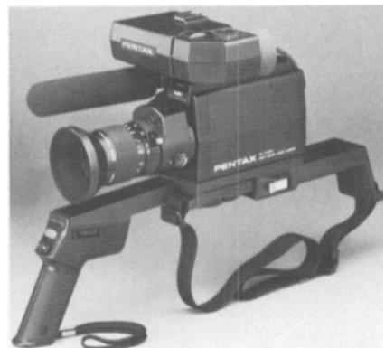
Pentax PC-K020A MOS color video camera.

WRC-3 wireless remote control for iris, focus, and zoom operation without external wires. The Model III electronics accept film and video cameras with no extraneous interface required. Prices start at $28,500.