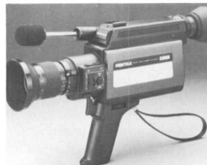
Pentax PC-K030A Saticon tube color video camera.

Standard lens for the MOS camera features auto-iris control with a manual override for fade-in/fade-out. The lens mount is a universal C-mount. The electronic viewfinder provides diopter correction and indicator lights. The viewfinder can be removed and attached to an extension cord for remote control and monitoring. Both the pause switch and the zoom control can be activated from the viewfinder. Other features include a telescoping boom microphone, an earphone jack, a quick review switch, and a shoulder brace.