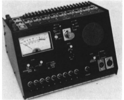
Program Interrupt Model PI 2320

for demanding applications. It is less flexible than the 1202, but features stability and accuracy of pulse widths, pattern, and element placement. The price is $4,900. The 1222 includes larger-scale integrated circuits and PROMs to establish raster format in an accurate, clocked, computer-type design. The price is $6000.