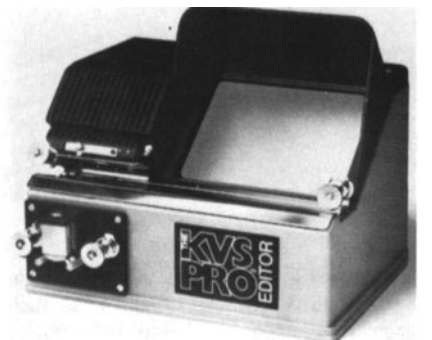
KVS Pro Editor

The Program Interrupt, Model PI 2320, a director's communication station especially designed for field use, has been announced by Broadcast Technology Inc., 33 Comac Loop, Ronkonkoma, NY 11779. It is a self-contained unit incorporating a microphone, speaker, and a VU meter operating from a choice of "D" cell batteries, BP 90 NiCad battery, or 120/240 V ac. The NiCad battery is trickle-charged from the ac supply. Connections to the two primary inputs as well as a 4-wire intercom are by XLR connectors or binding posts. Nine 600-ohm cue outputs made through XLR connectors or a parallel terminal strip may each select an individual external source through additional XLR connectors and parallel terminal strip. The nine outputs and the intercom may be interrupted by the director individually or simultaneously by momentary lever switches. A readily distinguishable signal generator may be switched into the interrupt bus for system checkout and line identification.