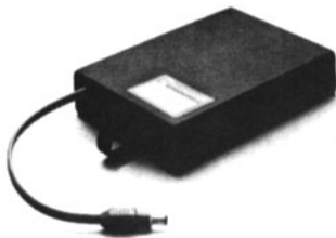
BP90 battery pack

A new type of film cleaning/conditioning system, the CF3000 VCS, that consumes considerably less cleaning fluid than previous designs, has been announced by Lipsner-Smith Co., 4700 Chase Ave., Lincolnwood, IL 60646. Based on the design of the CF-2 film cleaning system, the system has been changed by replacing the drying tower with a low-volume, high-pressure air cushion that returns to the system the fluid and vapor previously lost. Venting requirements are thus reduced. Components include refrigeration coils for vapor condensation and distillation system for recovery of contaminated solvent. The CF3000 handles 35-mm and 16-mm film on reels or flanges.