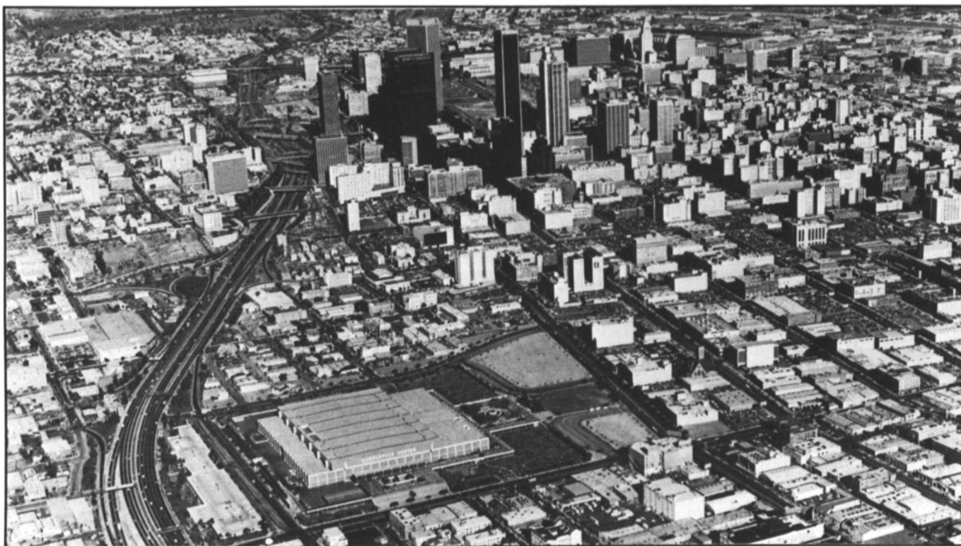
View of downtown Los Angeles, site of the Society's 125th Technical Conference.