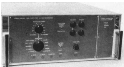
VII signal source 1202

The firm also announced the ADS-1000 digital video still store featuring a high-speed digital memory and an 8-in. Winchester Disk Drive. The system can store up to 218 fields of still pictures on one disk unit. By adding a maximum of four disk units, a total of 872 fields can be recorded. Features of the ADS-1000 include visual sorting of up to 16 pictures at one time, instant replay of still pictures (1 sec), and a built-in floppy disk to store pictures temporarily if the fixed disk is at capacity.