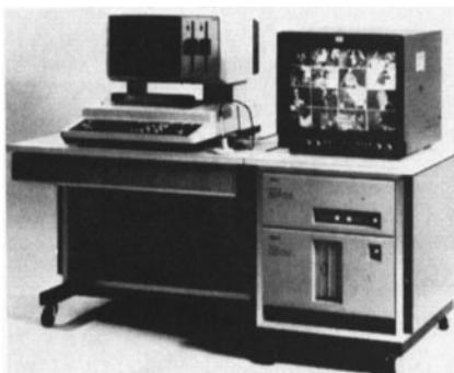
ADS digital video still store

Further information about these items can be obtained from the addresses given. As in the case of technical papers, the Society is not responsible for manufacturers' statements, and publication of these items does not constitute endorsement of the products or services.