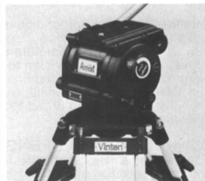
Avocet pan-and-tilt pedestal, W. Vinten Ltd.

announced by Asaca/Shibasoku Corp. of America, 12509 Beatrice St., Los Angeles, CA 90066. Features include automatic tracking of the video signal, establishing quantitative delay corresponding to the divergence of video and audio, and a high-performance sound processor with a wide dynamic range and minimal distortion gradation.