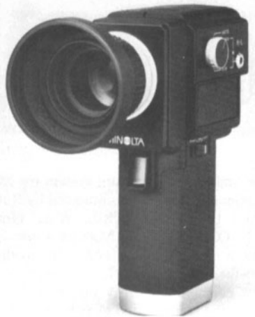
Luminance Meter 1°

A TV color analyzer, the TV-Color Analyzer II, has been announced by Minolta Corp., 101 Williams Dr., Ramsey, NJ 07446. The device enables objective white-balance adjustment in television production lines and broadcast studios, and can take measurements off any standard monitor, regardless of phosphor characteristics. In addition to the standard primary-analyzer mode for red-, green-, and blue-beam intensities, the Color Analyzer II features a chroma mode that shows chromaticity coordinates (x,y) and luminance in either candelas or footlamberts. In the chroma mode, white-standard or reference colors can be put into memory by simply adjusting the monitor until the desired coordinates are displayed, eliminating the need for white masters or comparators. The unit has four white-standard/reference-color memory channels, enabling white-balance adjustment of a variety of monitors.