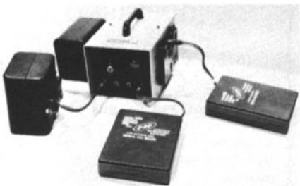
UN4 overnight charger

The TM-R9U color monitor has been announced by JVC Company of America, 41 Slater Dr., Elmwood Park, NJ 07407. It is a 9-in. professional, mid-resolution studio monitor. Features include underscan, which is controlled by a switch to allow video professionals to view the entire video image, including the rough edges. Internal/external sync locks the monitor into a video production or editing system. A built-in comb filter produces a sharp picture by separating luminance and chrominance signals. Other features include pulse cross, which delays the horizontal and vertical black bars, revealing them to the viewer, and a tally lamp. When the monitor is integrated into a complete video system (cameras, VCRs, switcher) the tally lamp indicates which video camera is "live."