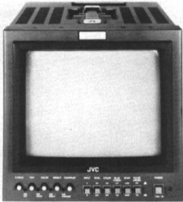
TM-R9U color monitor

users to make near real-time, repeatable measurements of color CRTs or other low-level light sources. The system also incorporates a 3 1/2-in. floppy disk that increases the storage capacity and versatility of the system and an RS-232 interface port to communicate with a host computer or terminal.