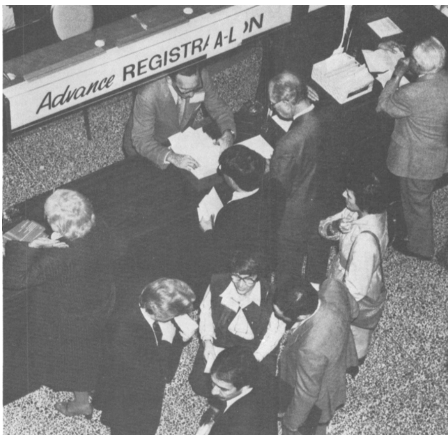
The registration area.

The Fellows Luncheon was held on Monday, during which the newly