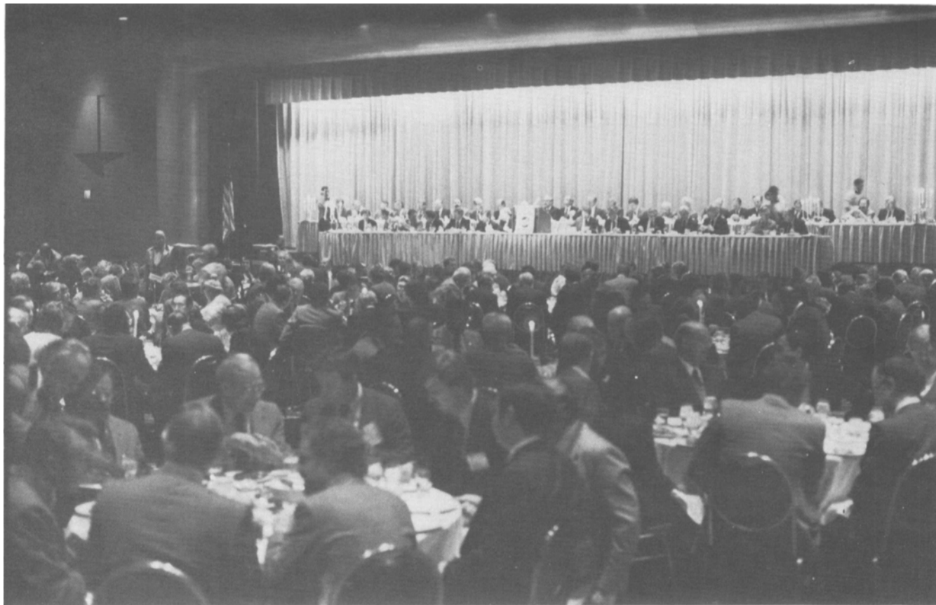
The Honors and Awards Luncheon.

days of technical sessions on the theme "Focusing on the Future of Image Technology." The program took place as follows: Monday morning, October 29 — Conference Opening: Focusing on the Future of Image Technology; Monday afternoon, Image Technology in Action; Tuesday morning — October 30, Laboratory Practices, concurrent with Film and Television Production; Tuesday afternoon, Film Technology, concurrent with Small Format Video; Wednesday morning — October 31, Film/Tape Interface I, concurrent with Image Sensors; Wednesday afternoon, Film/Tape Interface II, concurrent with Lighting and Batteries; Thurs-