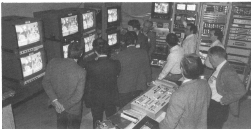
The component video system proposed by the SMPTE Working Group on Component Analog Video was demonstrated immediately preceding the conference at CBC's Studio 52.

The 18th Annual Television Conference of the Society of Motion Picture and Television Engineers (SMPTE) was held from Friday, February 10, to Saturday, February 11, 1984, at the Queen Elizabeth Hotel in Montreal. More than 700 television engineers, scientists, and technical and management people from all corners of the globe attended this internationally well-known conference.