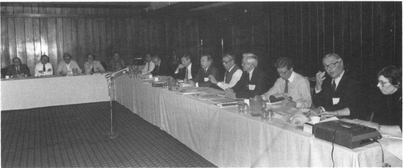
The meeting of the SMPTE Board of Governors.