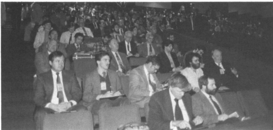
The CBC/BNR tutorial on digital video concepts, held the day before the conference at CBC Headquarters, was attended by an overflow audience of 325.