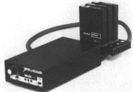
MS-1000 Mini Switcher, Comprehensive Video Supply Corp.

The V-8 switcher, an 8-channel (8 into 1) video switcher has been announced by FSR, Inc., 40 Commerce Rd., Cedar Grove, NJ 07009. The device, which can be remotely controlled, switches one of eight video lines to an output, leaving all other lines terminated into 75 ohms. A companion unit, the A-2, can switch eight audio lines into one.