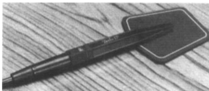
Model 12 SP microphone, Crown Int'l

The signal-to-noise ratio is greater than 88 dB. Frequency response is flat from 20 to 20,000 Hz. The unit can store and reproduce 60 min of mono recording time or 30 min of stereo per disk. Its expandable architecture can accommodate as many as 60 separate disk drives, offering a storage capacity of up to 60 hr mono and 30 hr stereo program material.