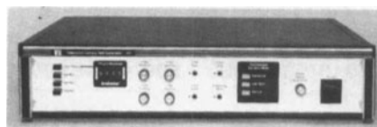
Model 151 TV bar/dot and line finder, Vii

The Model 12 SP microphone for professional use , has been announced by Crown International, 1718 W. Mishawaka Rd., Elkhart, IN 46517. It offers studio quality for recording, sound reinforcement, broadcasting, and electronic news gathering. The microphone is phantom-powered by an 18 to 48-V supply. Features include a transformer-balanced, low-impedance output available at an integral 3-pin connector. It has a hemispherical pickup pattern and a windscreen for outdoor or close-up use.