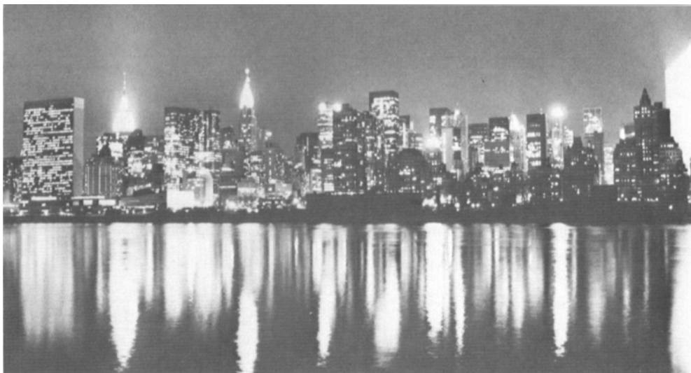
Skyline of New York.

Advance registration packets can be picked up at the ACVL Registration Table on Saturday, October 27, beginning at 8:00 a.m. outside the Trianon Ballroom in the New York Hilton. From 10:00 a.m. Sunday, advance registrations can be obtained at the SMPTE registration area of the New York Hilton. Regular registration will commence on Sunday, October 28, at 12 noon and continue until 5:00 p.m., registration desks will open Monday through Friday at 8:00 a.m. Spouses'