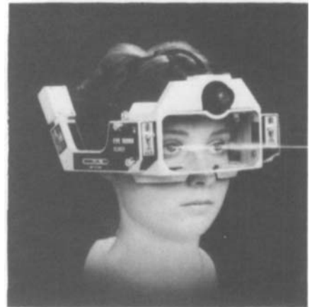
Instrumentation Marketing NAC Eyemark recorder

13361 Beach Ave., Marina, Del Rey, CA 90292