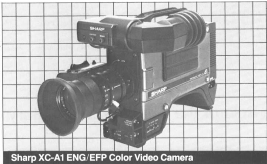
Sharp XC-A1 ENG/EFP Color Video Camera

Leave it to Camera Mart to bring you quality and reliability at a reasonable price. Witness: the new Sharp XC-A1 color video camera.