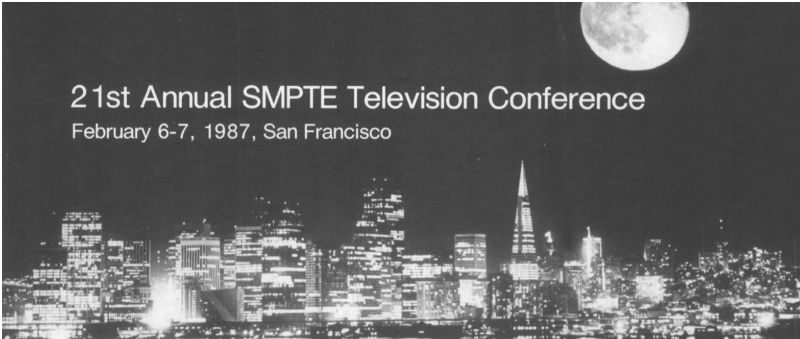
Moonlit view of the beautiful San Francisco skyline.

The Society's 21st Annual Television Conference will be held February 6-7, 1987, at the St. Francis Hotel, San Francisco, Calif. The theme of the conference, "The 21st Conference Looks to the 21st Century," will focus on forward-looking papers that provide a glimpse into the future of television between now and the year 2000.