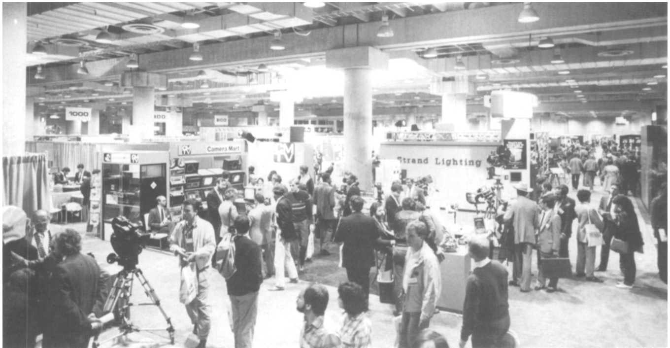
The equipment exhibit was the largest in SMPTE history.