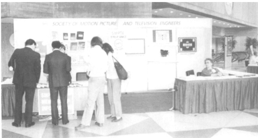
The SMPTE booth in the registration area.