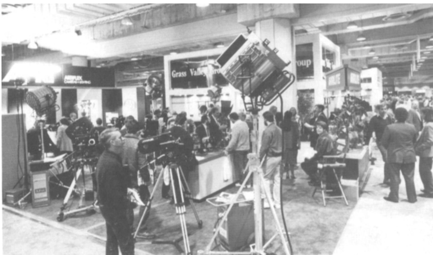
A record-breaking crowd attended the exhibit.