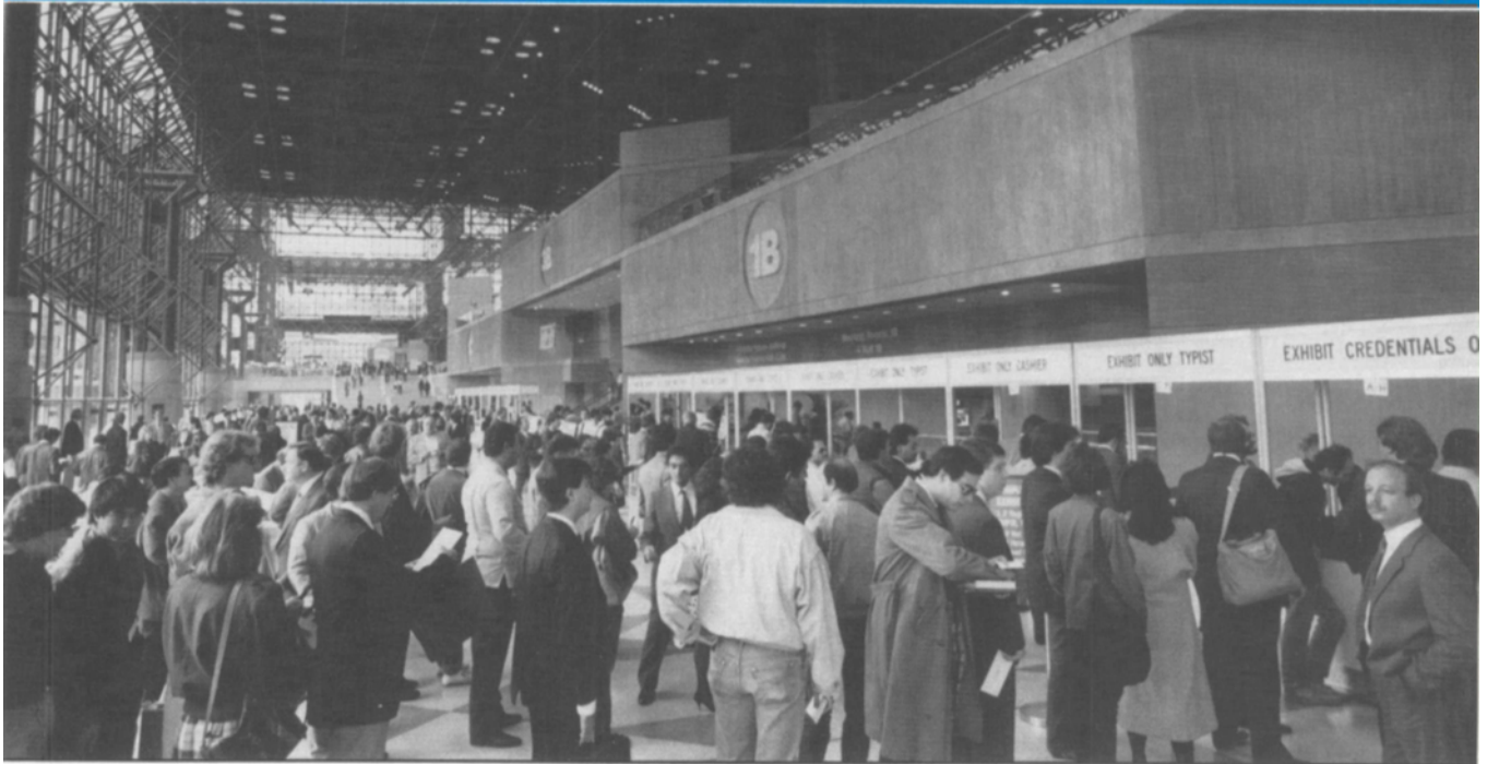
Registration for the Conference.