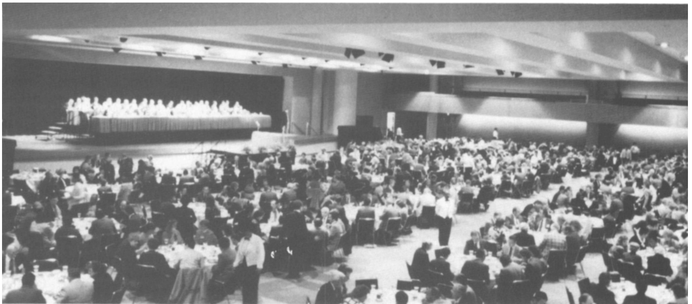
The Honors and Awards Luncheon.