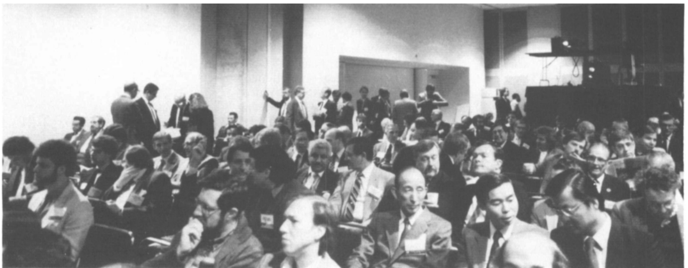
The opening session was truly "standing room only."