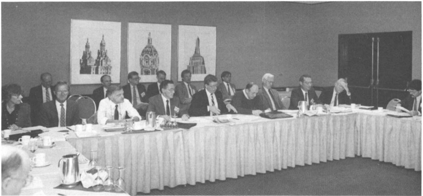
The Board of Governors meeting.

and was open to visitors from Saturday through Tuesday.