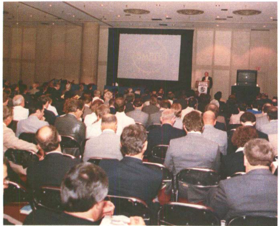
Most sessions were very well attended. Here is the audience at the opening session.