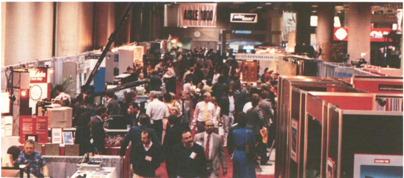
The SMPTE Equipment Exhibit.