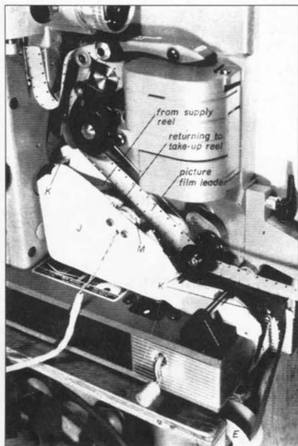
Close-up of film threading, including the attachment which positions the guide rollers and a supplementary magnetic head • A Portable Synchronous Interlock Projection System • R. Zeper • JSMPT , December 1963