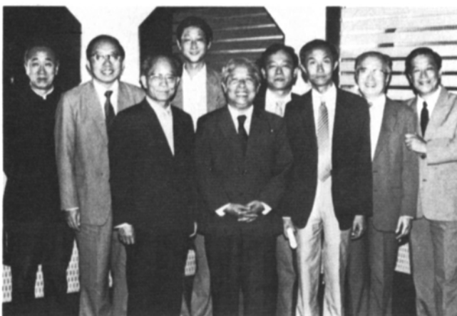
Members of Chinese delegation.