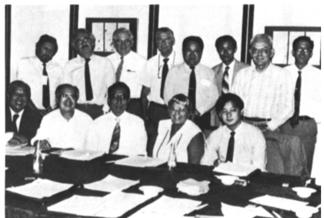
Meeting of Working Group 5 — Film/Electronic Interface.