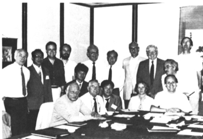
Heads of delegations and Working Group members.