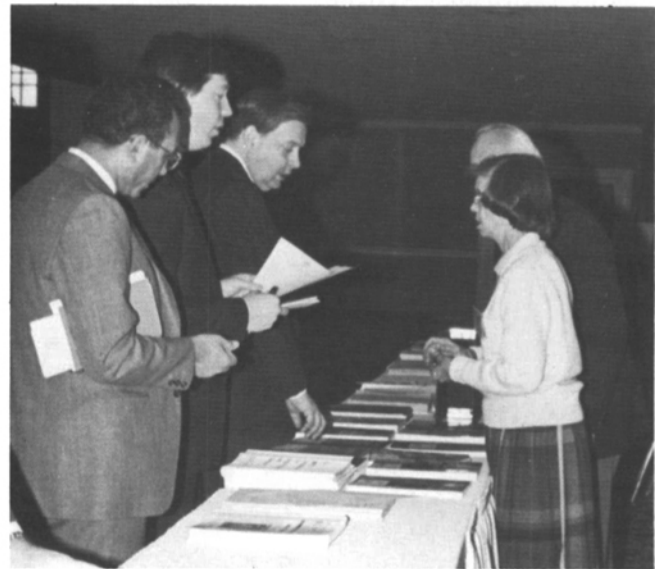
SMPTE publications and informational brochures on display directly outside the session room on both days of the conference.