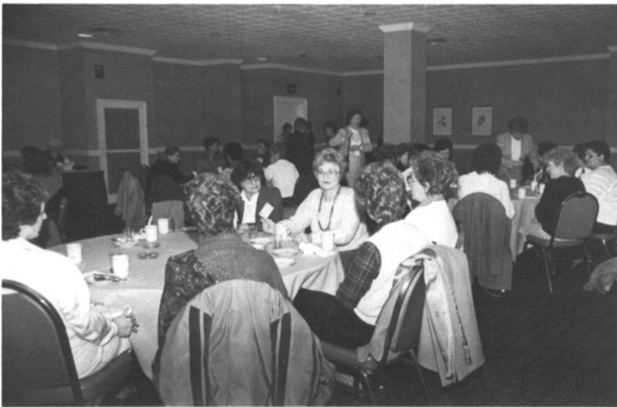
Spouses enjoy a continental breakfast at the Opryland Hotel before taking in the sights and sounds of historic Nashville.