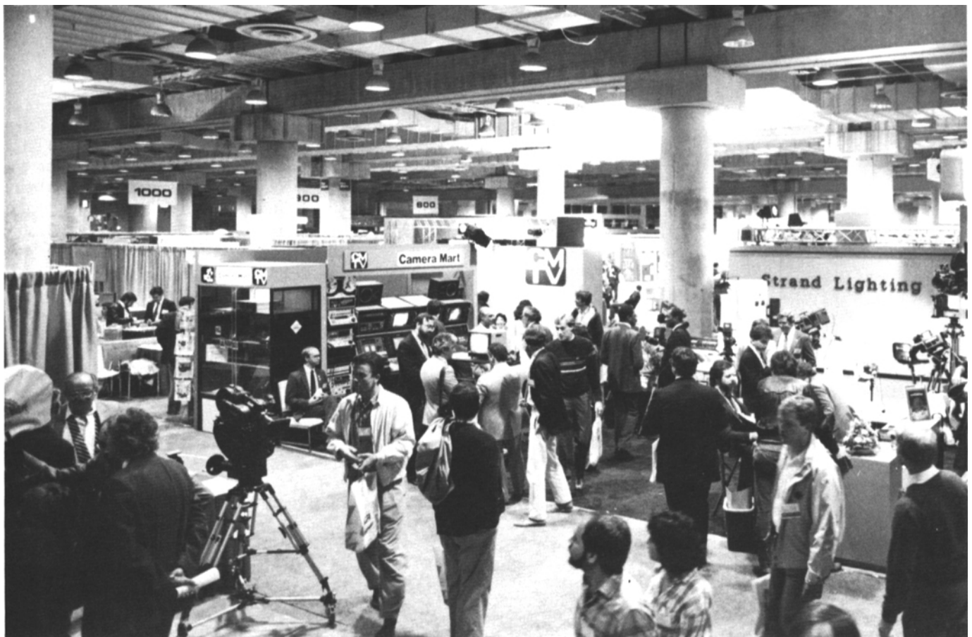
The equipment exhibit at 1986 SMPTE conference.