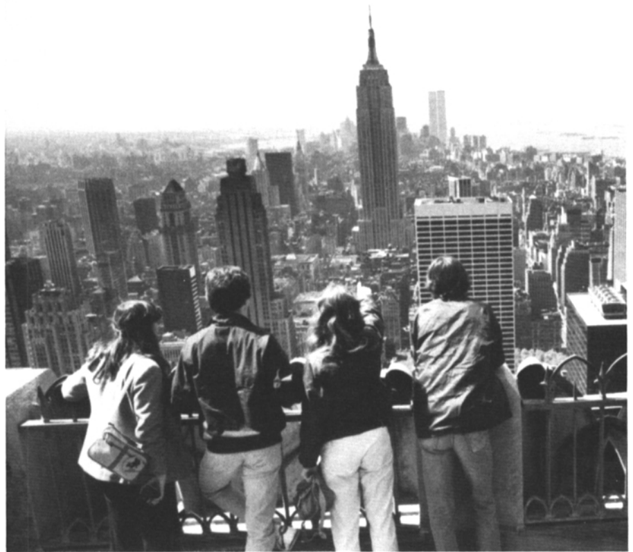
A view of New York, site of the SMPTE Conference.