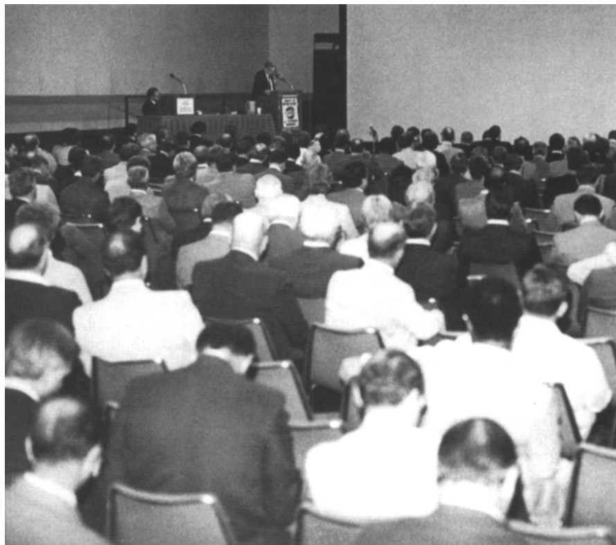
A session at the 1986 New York conference.