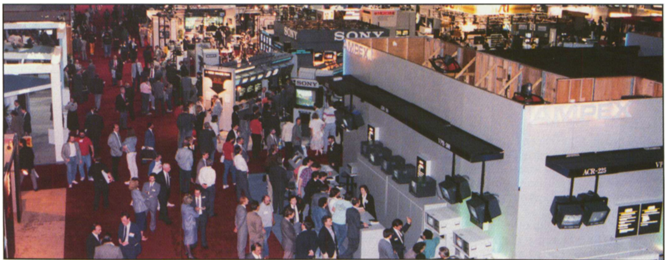
The SMPTE Equipment Exhibit.

The Society appreciates the efforts of all the people and companies who participated, which resulted in a very successful 131st Technical Conference and Equipment Exhibit. A more detailed report on the conference will appear in the January 1990 issue of the Journal . — Joyce R. Hurwitz