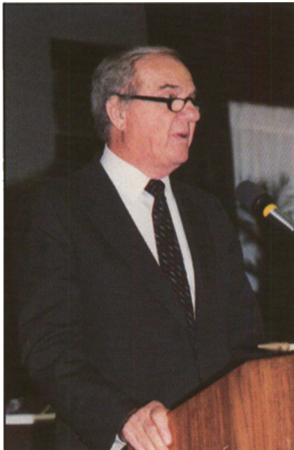
Honors and Awards Luncheon guest speaker Karl Malden.