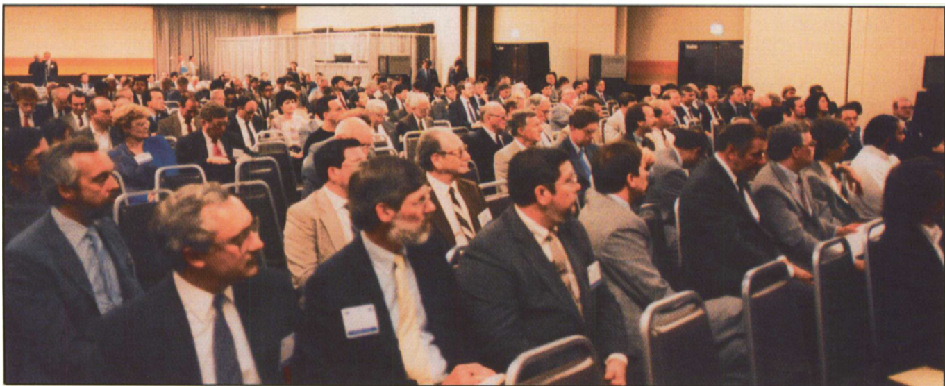
The opening session.

The Honors and Awards Luncheon, held in Petree Hall of the Convention Center on Saturday, October 21, featured the presentation of 22 SMPTE awards recognizing outstanding achievements in motion pictures and television and service to the Society. A reception, sponsored by