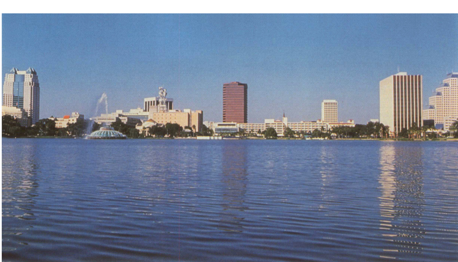
The Orlando skyline.