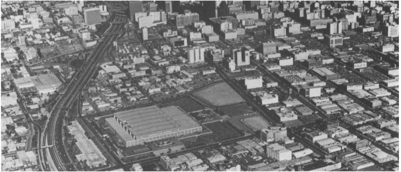
Downtown Los Angeles and the convention center.