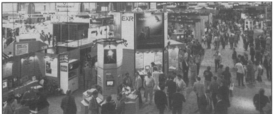
The equipment exhibit at the NAB Convention.