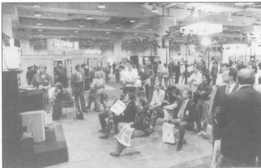
Attentive audience at demonstration held during the exhibit.

The high point of the conference social events, the gala Banquet, was held in the Broadway Ballroom of the Marriott Marquis on Tuesday, October 16. Guests enjoyed a pre-banquet reception and a lively evening of dining and dancing at this annual dinner dance. Continuing the SMPTE tradition, accompanying spouses had a full program of special activities arranged for their enjoyment.