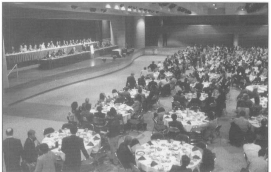
Overview of the Honors and Awards Luncheon.