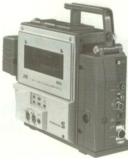
JVC BR-S411U dockable/portable recorder

An S-VHS dockable/portable recorder has been made available by JVC Professional Products Co., 41 Slater Dr., Elmwood Park, NJ 07407. The BR-S411U docks with any of JVC's professional CCD cameras to form a well-balanced, lightweight camcorder. The recorder's built-in interface adapter makes portable operation possible with any video recorder as well. As an editing feeder, the BR-S411U combines with an editing recorder such as the BR-S811U using the RM-G410U editing control unit.