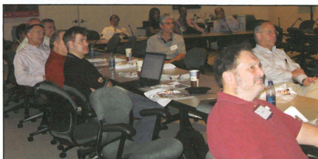
Ever-attentive SMPTE DC members.