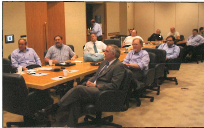
SMPTE DC Section members at the NAB wrap-up meeting (note the blue shirts).