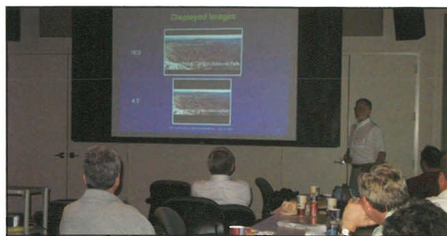
PowerPoint from the SMPTE DC presentation on AFD & Bar Data.

The goals of SMPTE’s S22 Image Formatting Group’s have been to optimize the image display for the viewer, taking into account multiple production aspect ratios and at least two display aspect ratios; provide guidance for