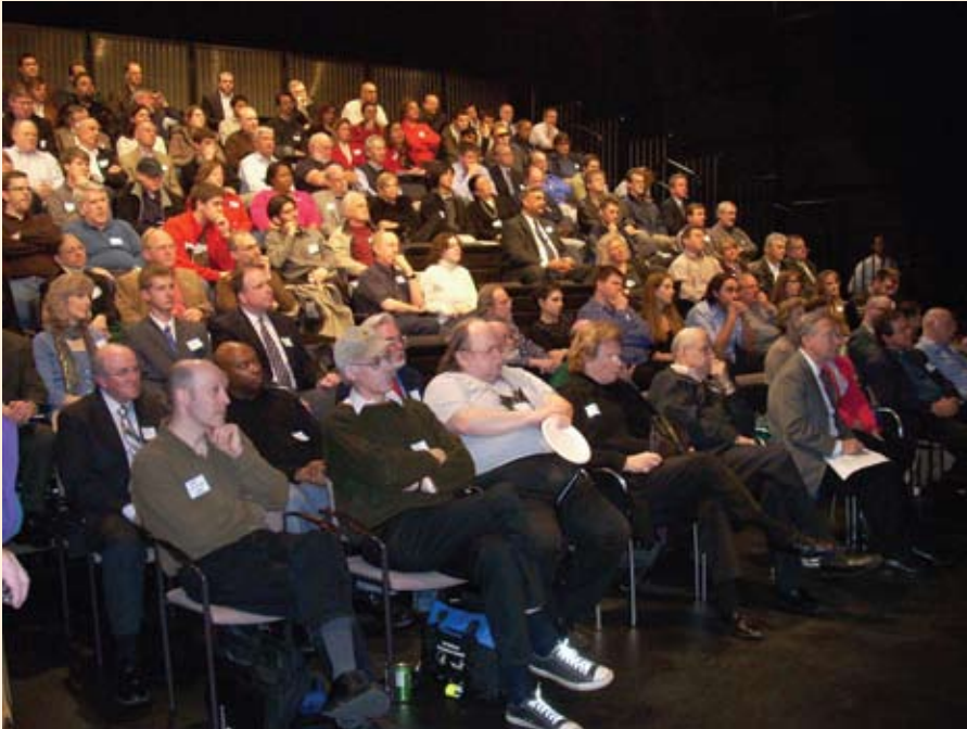
Attendees at the D.C. Section's March meeting filled the Newseum studio's installed riser seating to capacity.