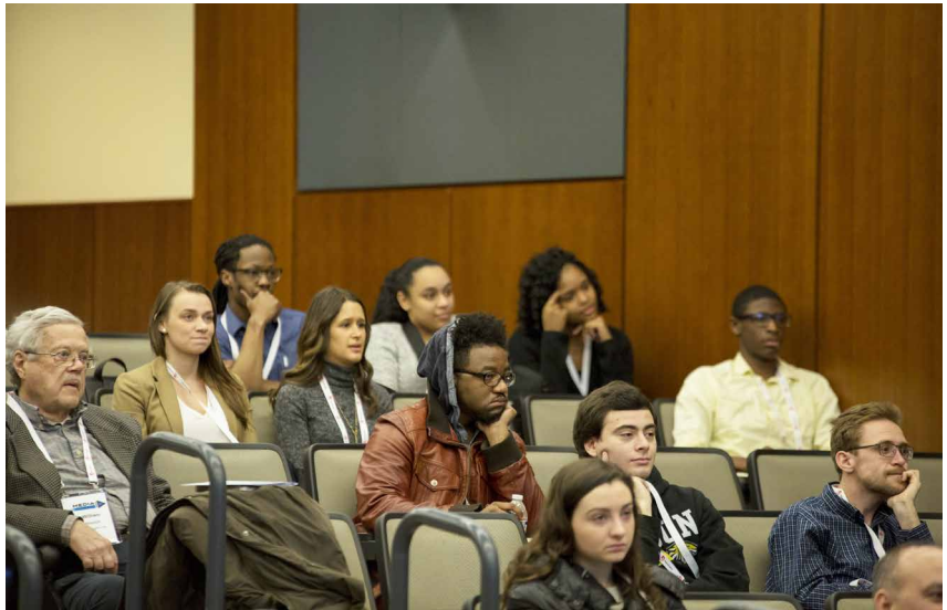
Attendees at the Washington, D.C., Section's MediaForward event in March.

On Saturday 23 March, the Washington, DC, Section held the first SMPTE Media Forward , an all-day event that is designed to introduce students to the vast range of career opportunities in media technology, build relationships, and open doors to the future. More than 80 people registered for the event ranging from 7th grade students