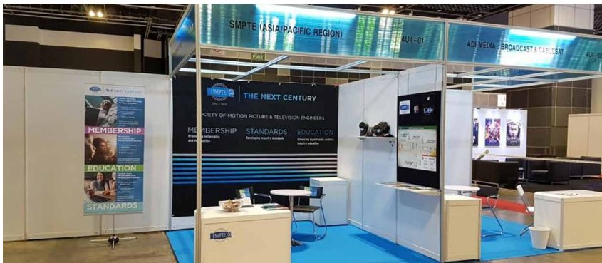
The SMPTE (Asia/Pacific Region) booth at Broadcast Asia 2018.

Most of the exhibits were in the areas of high dynamic range (HDR), IP broadcasting, wireless production, immersive technology, TV Everywhere, audio, and lighting. One booth that attracted many visitors was the application of digital signage using holographic techniques.