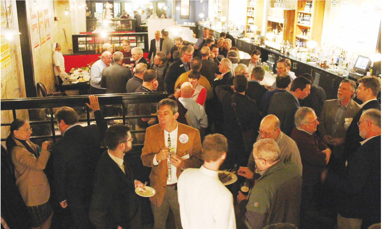
Members of SBE's Chapter 37 and the Audio Engineering Society joined Washington, D.C., Section members and guests for a joint December holiday party held at the Baby Wale restaurant in downtown Washington.