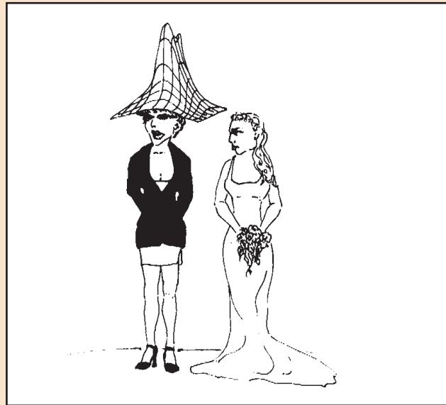
The bride was not impressed with her sister's choice of hat for the occasion. Phase correlation is the height of fashion! (Fig. 7 from SMPTE J. , Sept. 2000, p. 724.).